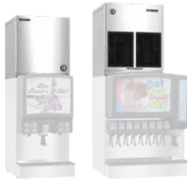
KMD-410MAH on Lancer Dispenser