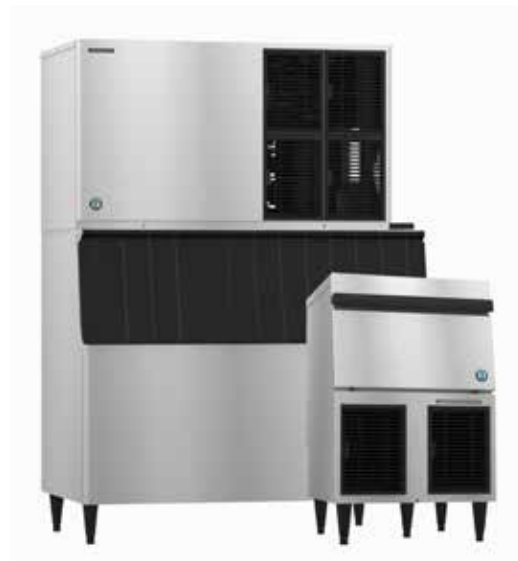
KM-1601S on B-900

Customers will enjoy the popular, chewable cubelet ice or crystal clear crescent ice for a variety of applications.