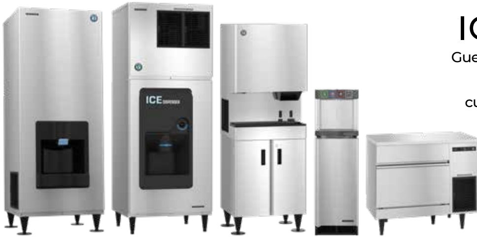
DKM-500BAJ KML-700MAJ on DB-200H DCM-300-BAH-OS on SD-500 Stand DWM-20A on C-80BAJ IM-200BAC