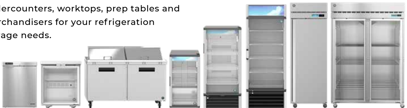
HR24B UR27A-GLP01 SR60A-24M RM-7-HC RM-10-HC RM-26-HC F1A-FSL R2A-FG

Offering a wide variety of uprights, undercounters, worktops, prep tables and merchandisers for your refrigeration storage needs.